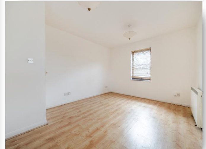
Flat 1 Norwich House, Norfolk Road, Maidenhead SL6 7AZ