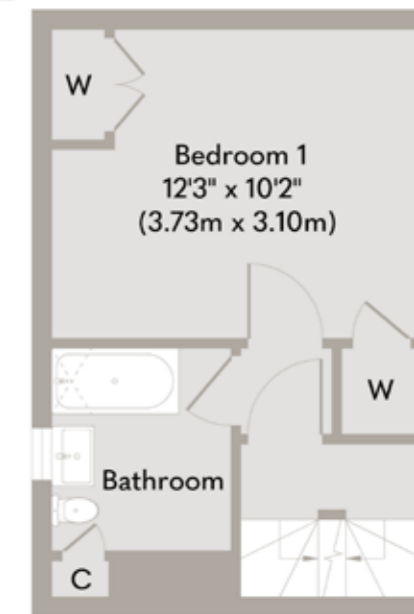
First Floor Approximate Floor Area 236 sq. ft (21.92 sq. m)