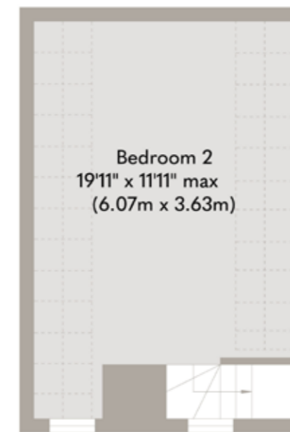
Second Floor Approximate Floor Area 236 sq. ft (21.92 sq. m)