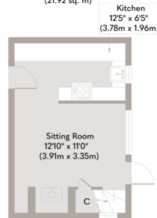
Ground Floor Approximate Floor Area 236 sq. ft (21.92 sq. m)