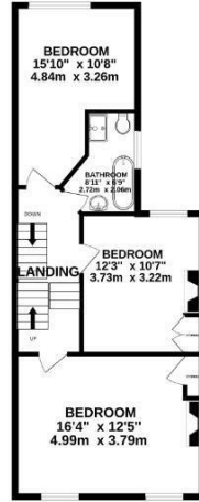
1ST FLOOR 589 sq.ft. (54.7 sq.m.) approx.