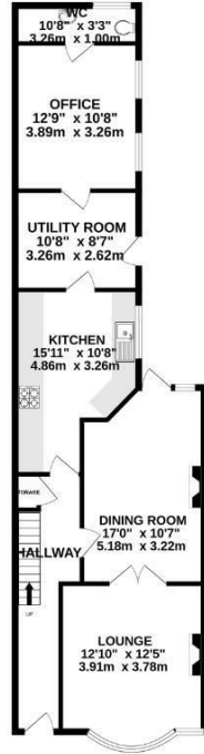
GROUND FLOOR 842 sq.ft. (78.2 sq.m.) approx.