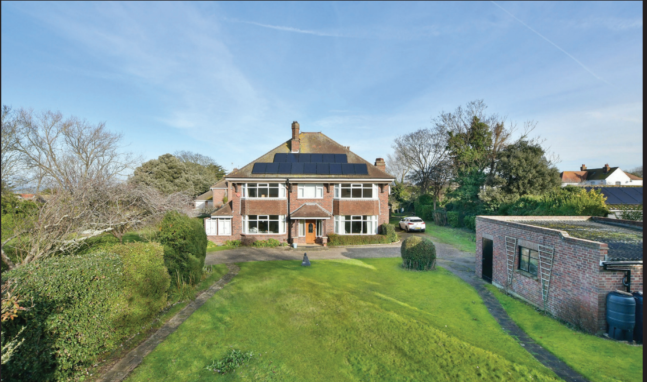
74 Kingsgate Avenue Broadstairs | Kent | CT10 3LW