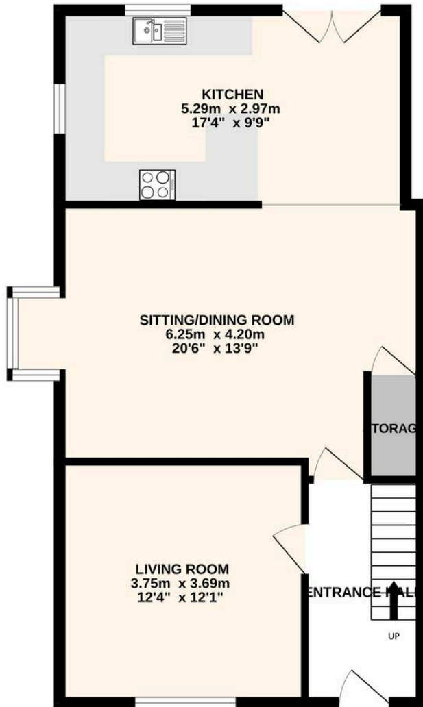
GROUND FLOOR 58.8 sq.m. (632 sq.ft.) approx.