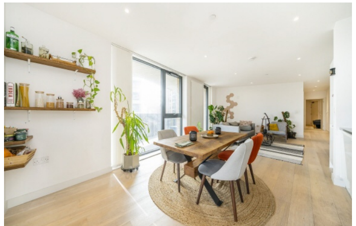
Starboard Way, E16