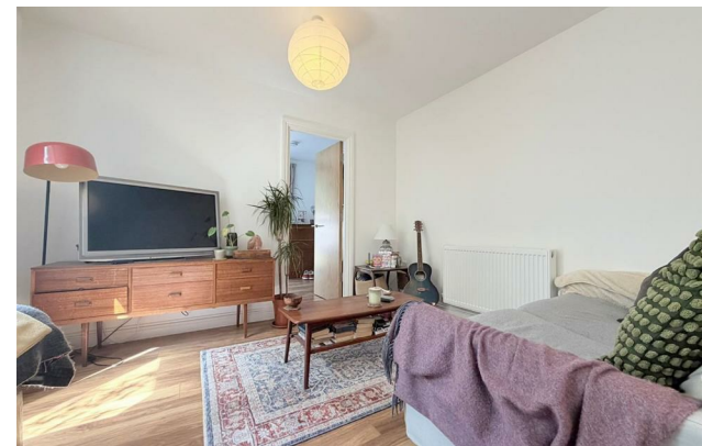
Withdean Road, Brighton, BN1 5BL £1,500 Per month -