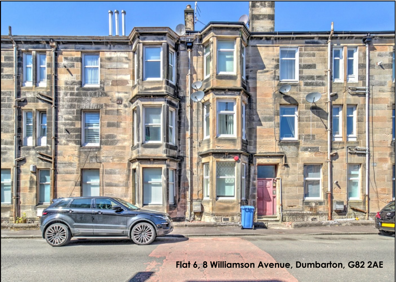
Flat 6, 8 Williamson Avenue, Dumbarton, G82 2AE

A beautifully presented one-bedroom first-floor flat forming part of a traditional tenement on ever-popular Williamson Avenue. Offering generous proportions, classic period character and superb everyday convenience, this property is ideally positioned close to a wide range of local amenities and excellent public transport links.