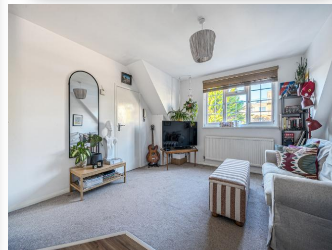
Flat 5, 42 Forlease Road, Maidenhead SL6 1RU