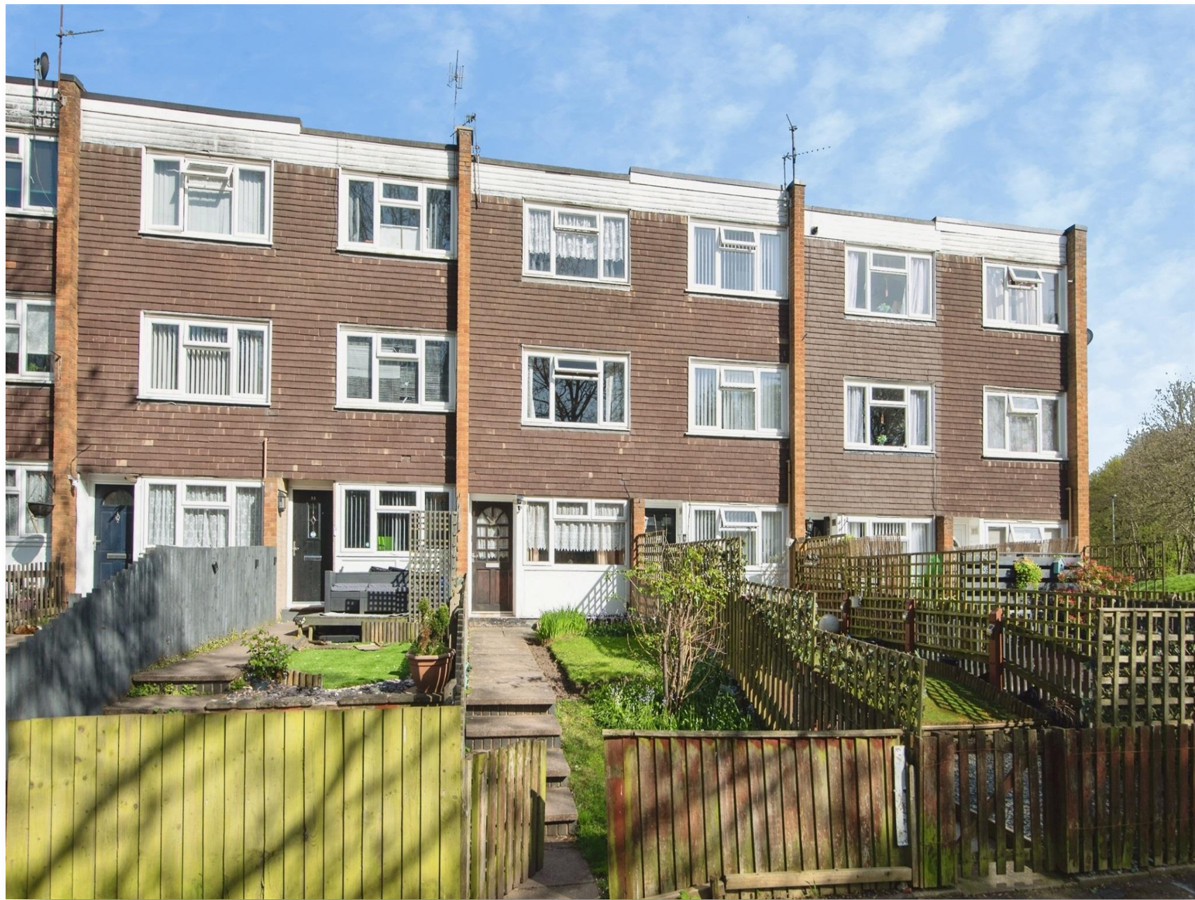
Springfield Lane, Rowley Regis B65 8PG