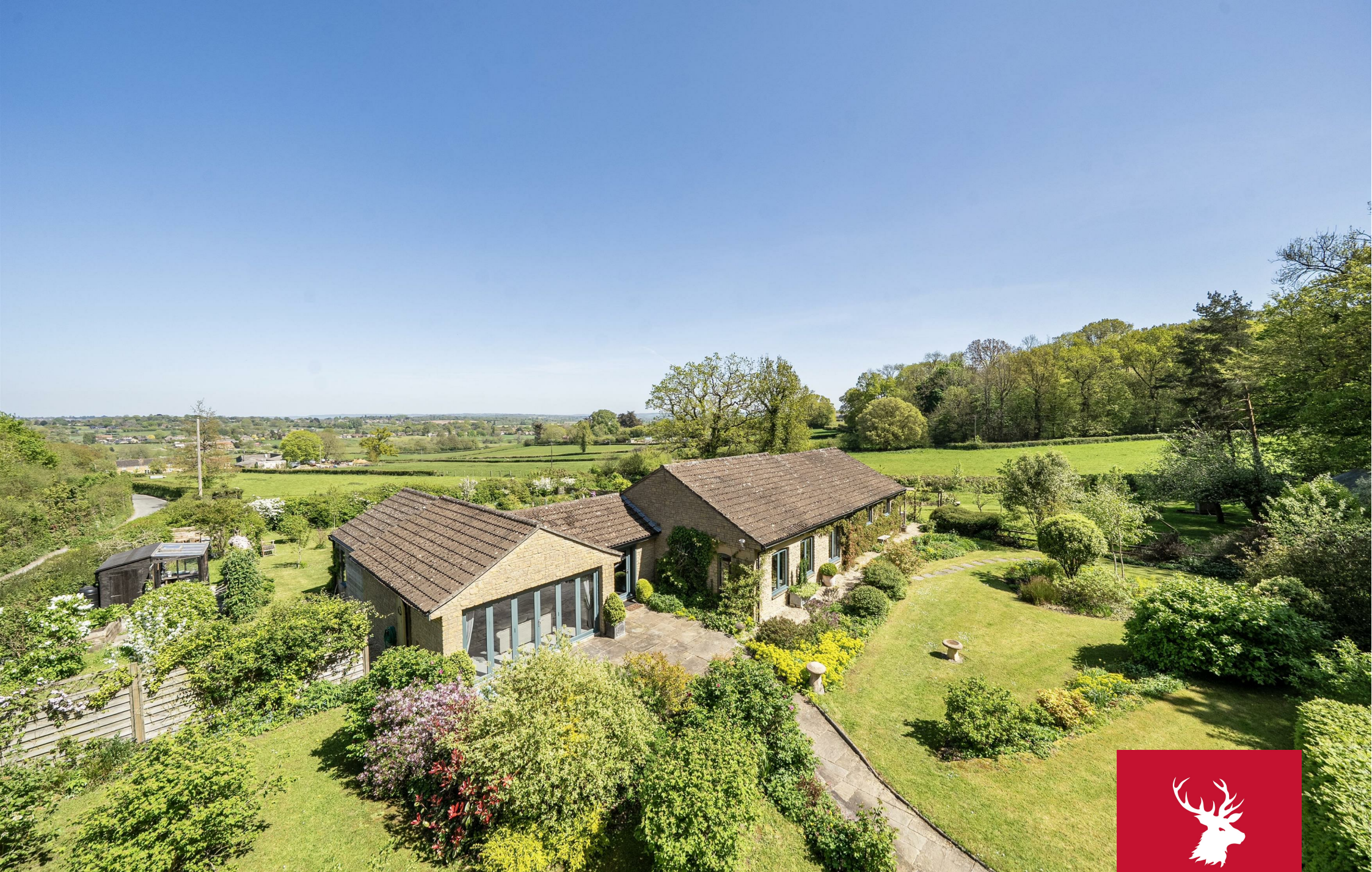
Woodview, Primrose Hill