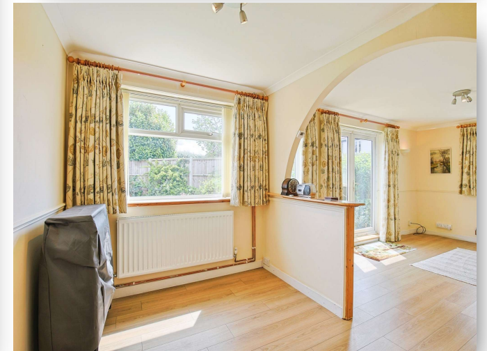
Cadogan Road, Bury St. Edmunds, IP33 3QJ