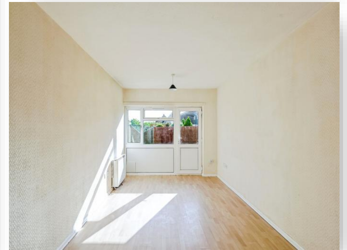
Castle Avenue, Northampton NN5 6JZ