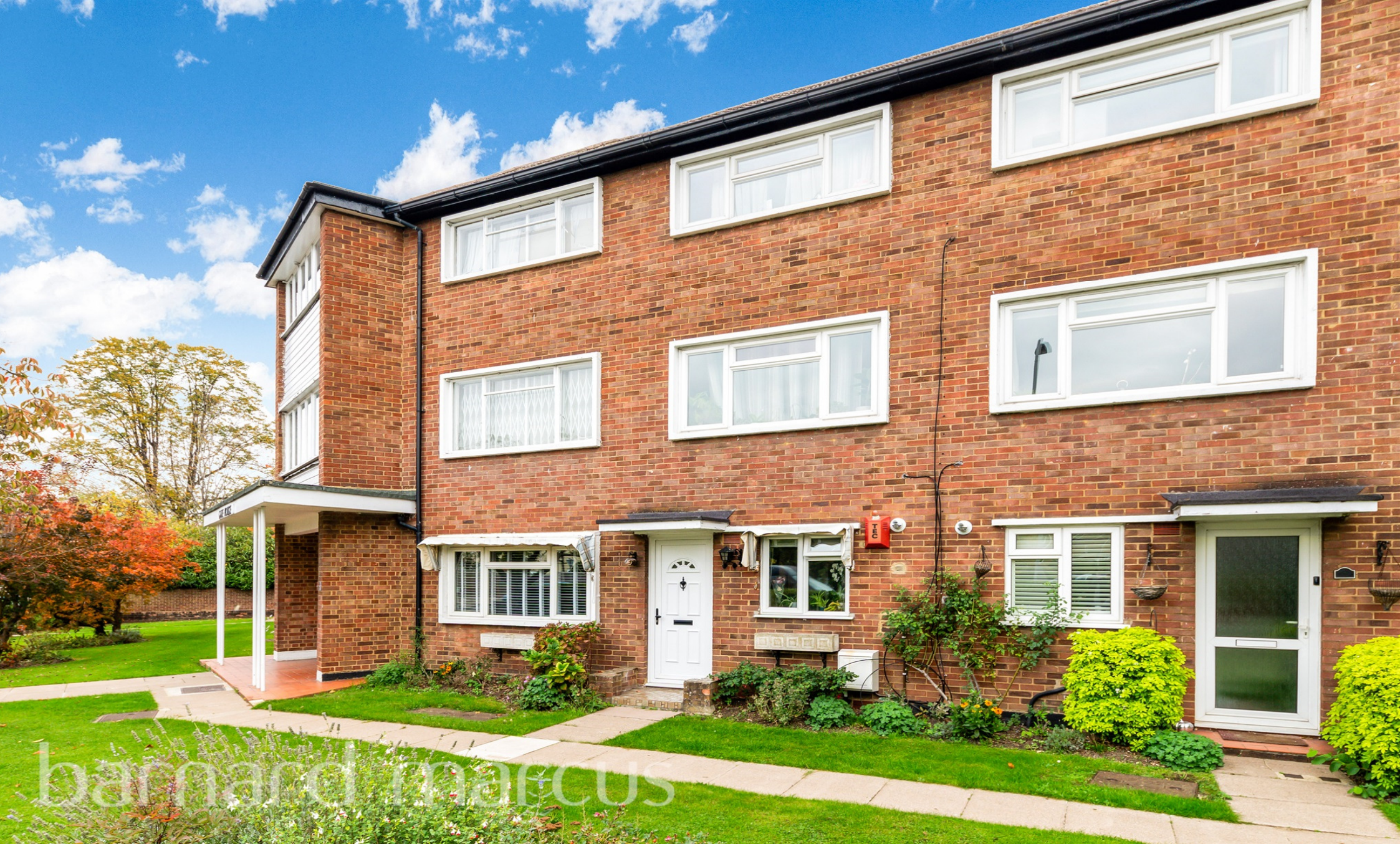
Gate House, Ditton Road, Surbiton, KT6 6RQ