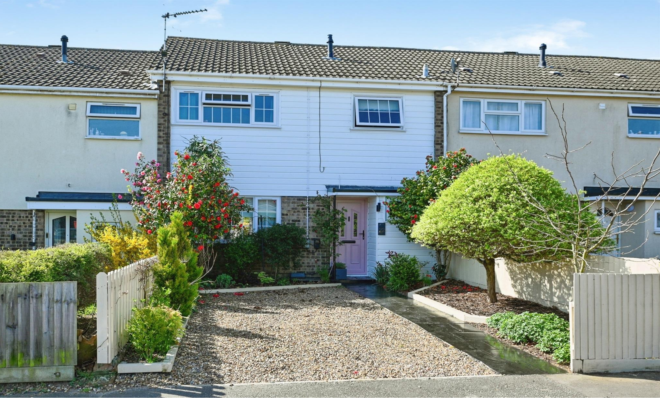
Filberts, King's Lynn, PE30 4SW