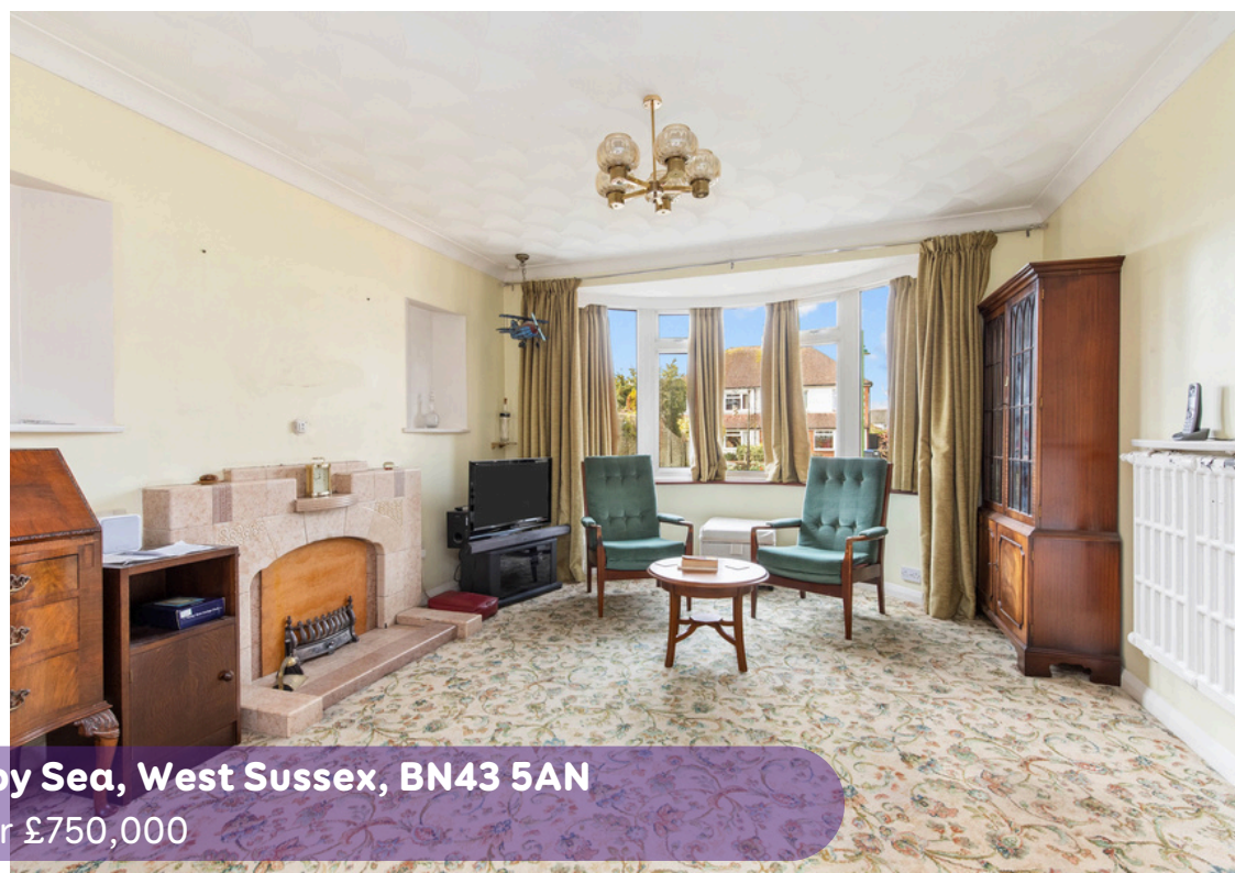
Southdown Road, Shorehamby Sea, West Sussex, BN43 5AN Offers Over £750,000