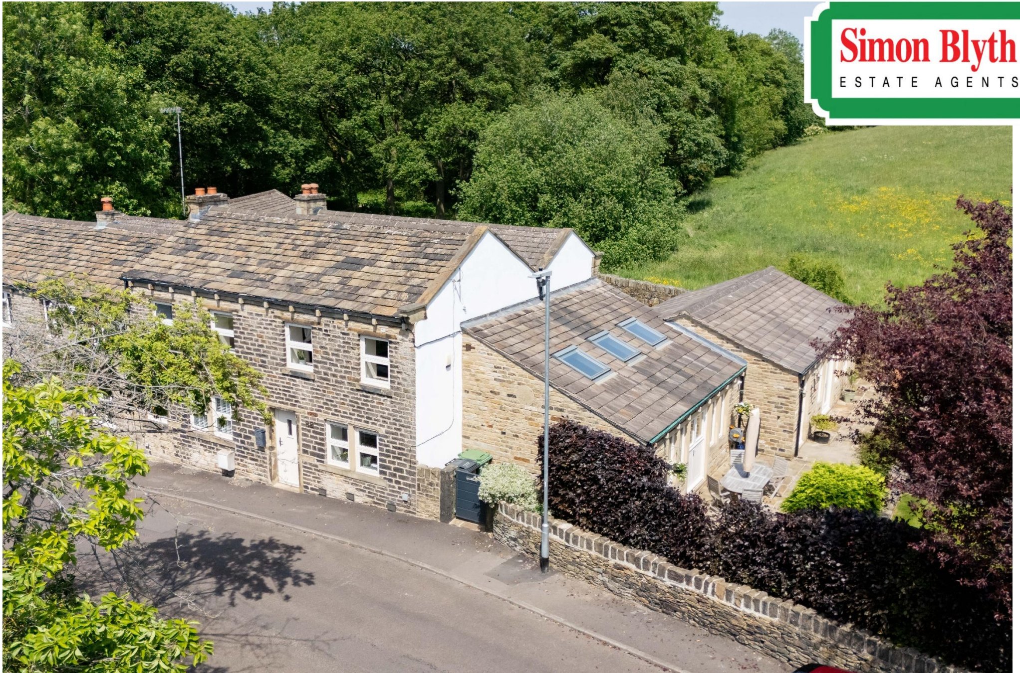
HAZEL COTTAGE, HALL ING LANE, HONLEY, HD9 6QR