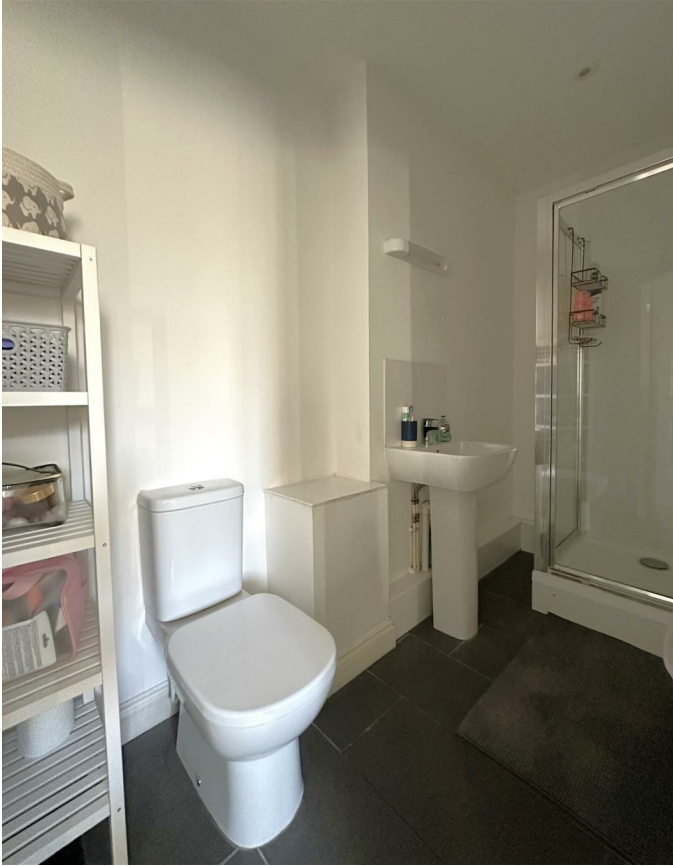
Toilet, wash hand basin, shower cubicle and towel radiator.