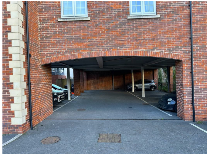
There is a numbered parking space for one car. There are additional visitors spaces.