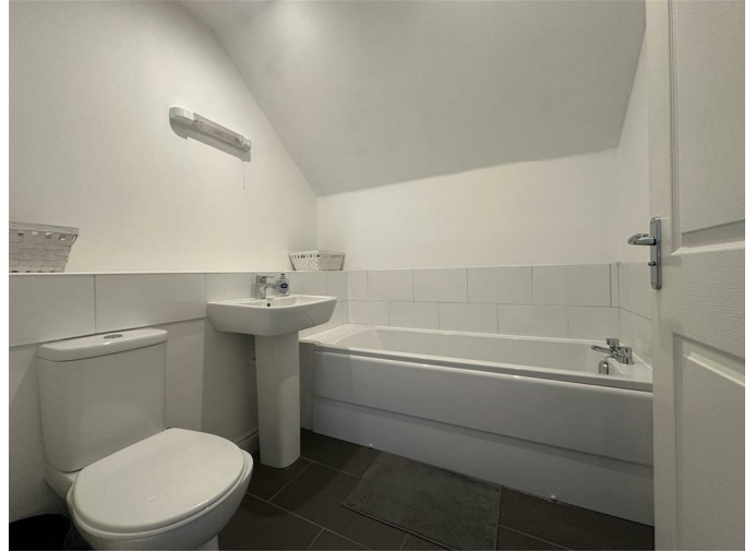
Toilet, wash hand basin, bath and towel radiator.