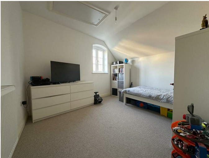
Double glazed window to the front and radiator.