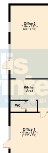
Ground Floor Approx. 58.0 sq. metres (624.6 sq. feet)

Total area: approx. 58.0 sq. metres (624.6 sq. feet)