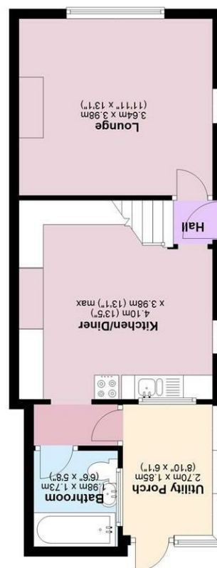
Ground Floor Approx. 41.9 sq. metres (451.0 sq. feet)