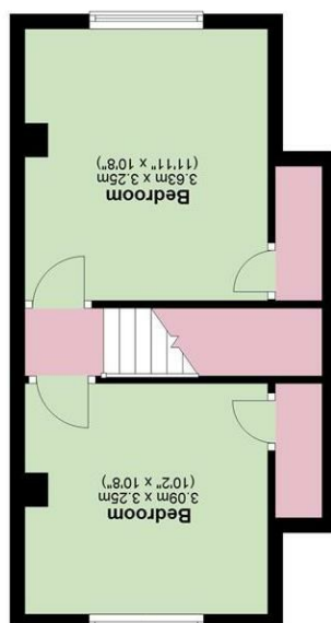
First Floor Approx. 28.9 sq. metres (311.0 sq. feet)

Total area: approx. 70.8 sq. metres (762.0 sq. feet)