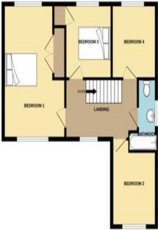
TOTAL FLOOR AREA: 1223 sq.ft. (113.6 sq.m.) approx.

Whilst every attempt has been made to ensure the accuracy of the floorplan contained here, measurement of doors, windows, rooms and any other items are approximate and no responsibility is taken for any error, omission or mis-statement. This plan is for illustrative purposes only and should be used as such by any prospective purchaser. The services, systems and appliances shown have not been tested and no guarantee as to their operability or efficiency can be given. Made with Metropix 02028