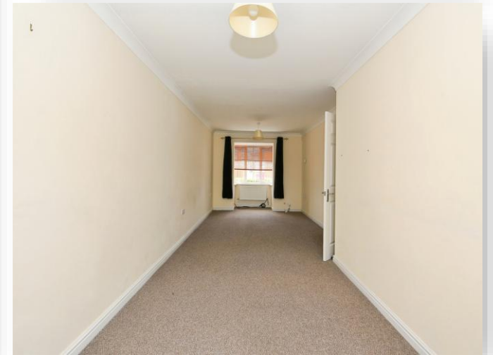
Aston Close, Yaxley Peterborough PE7 3BF