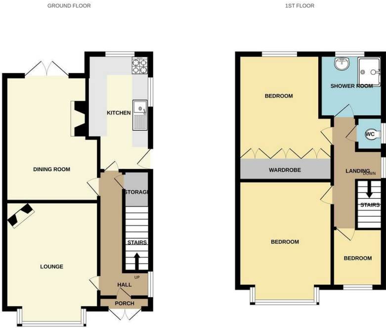
16 NORFOLK ROAD

Whilst every attempt has been made to ensure the accuracy of the floorplan contained here, measurements of doors, windows, rooms and any other items are approximate and no responsibility is taken for any error, omission or mis-statement. This plan is for illustrative purposes only and should be used as such by any prospective purchaser. The services, systems and appliances shown have not been tested and no guarantee as to their operability or efficiency can be given. Made with Hectag 02025