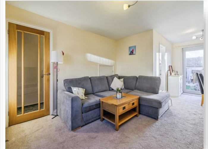
Yealmpstone Close, Plymouth PL7 1XL