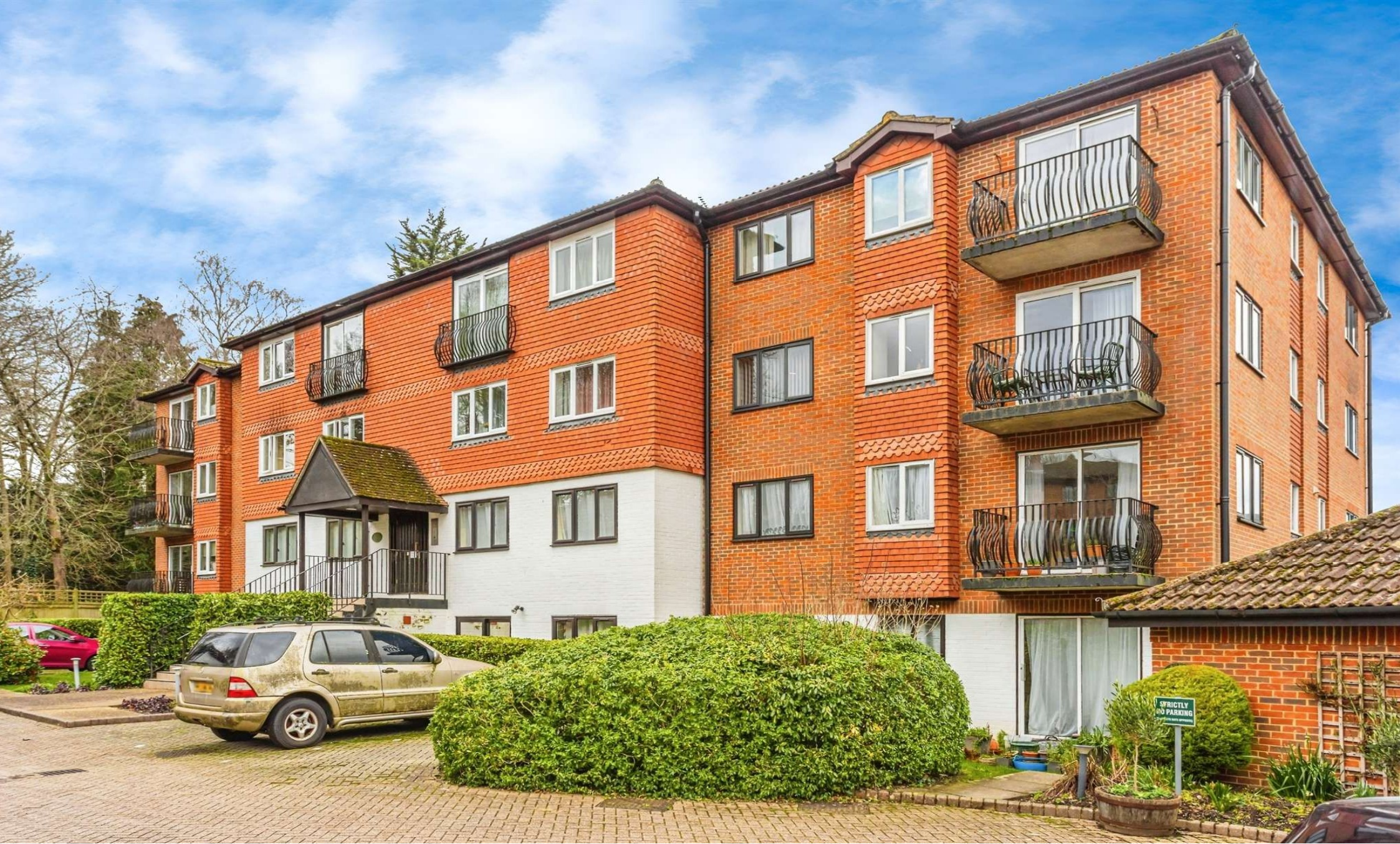
Wilton House, Great Heathmead, Haywards Heath RH16 1FG