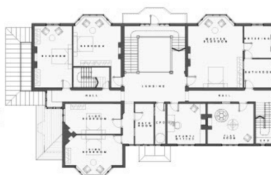
Proposed First Floor Plan