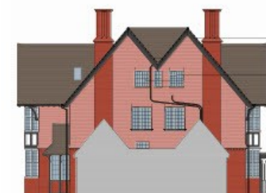
Proposed Side Elevation (Section)

Barge boards to be repainted black to match existing.