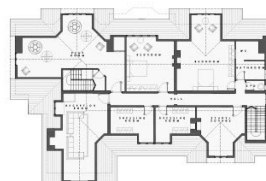
Proposed Second Floor Plan

Do not scale from this drawing. Work to figured dimensions only. Dimensions to be taken on site prior to manufacture, fabrication or installation.