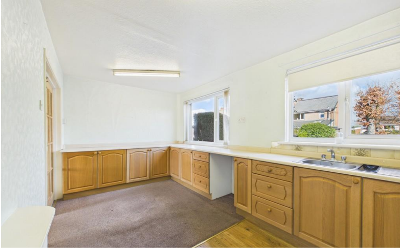
Kitchen/ dining room