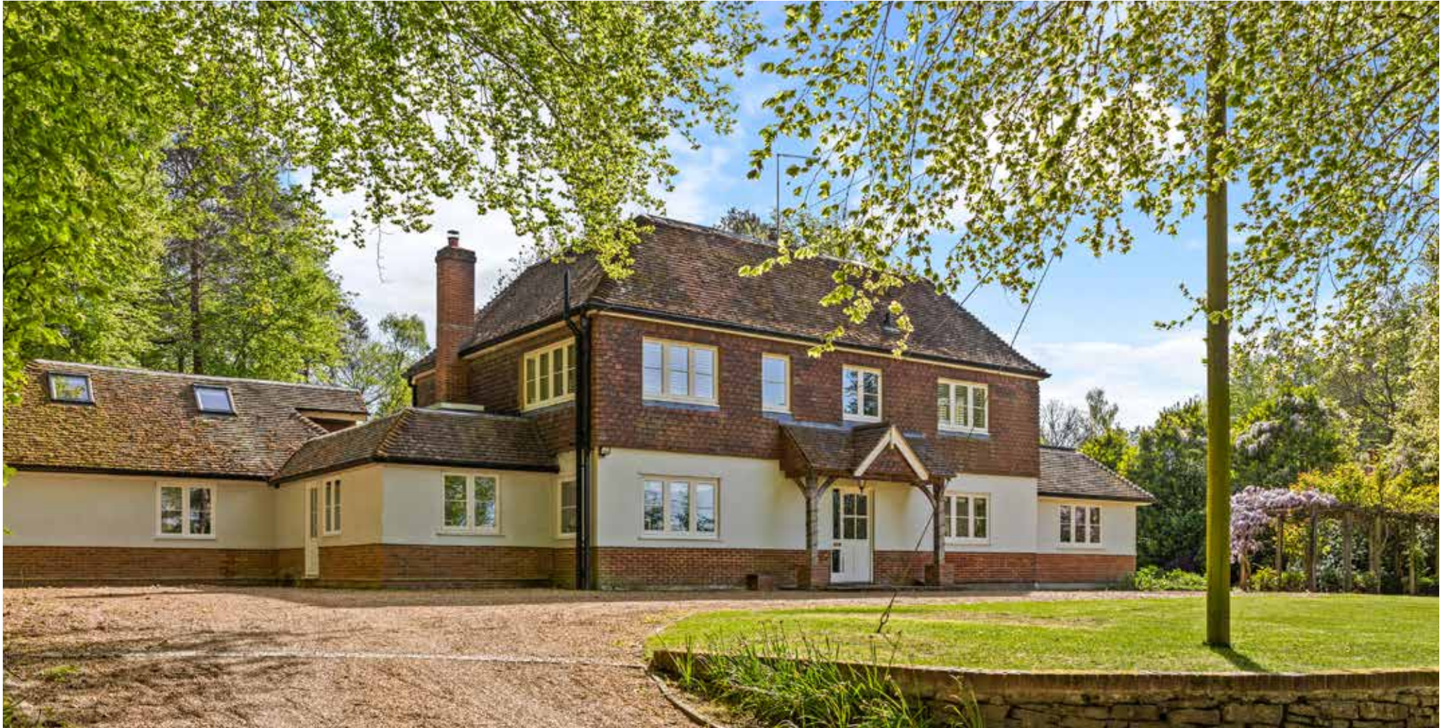
PINEHURST, HEADLEY HILL ROAD, ARFORD