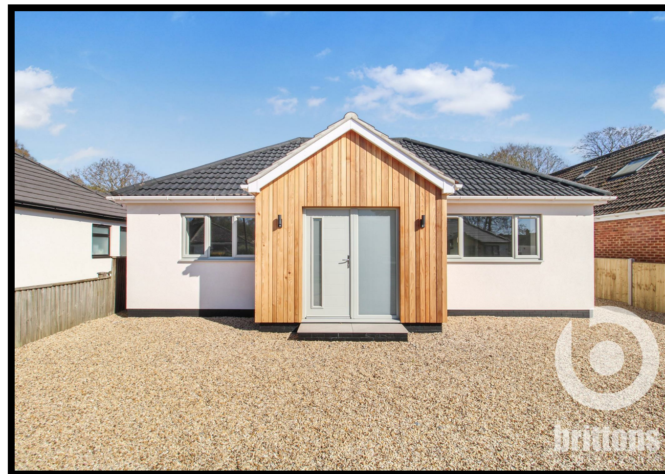
6, Woodside Close Dersingham King's Lynn, Norfolk PE31 6QD

IMPORTANT NOTICE: The services, central heating system, together with any appliances included in these particulars have not been tested by the agents and therefore cannot be guaranteed to be in full working order. We advise all prospective purchasers to employ their own independent qualified experts prior to purchase, as we are not qualified to express an opinion on these matters and therefore take no responsibility for their suitability or function.