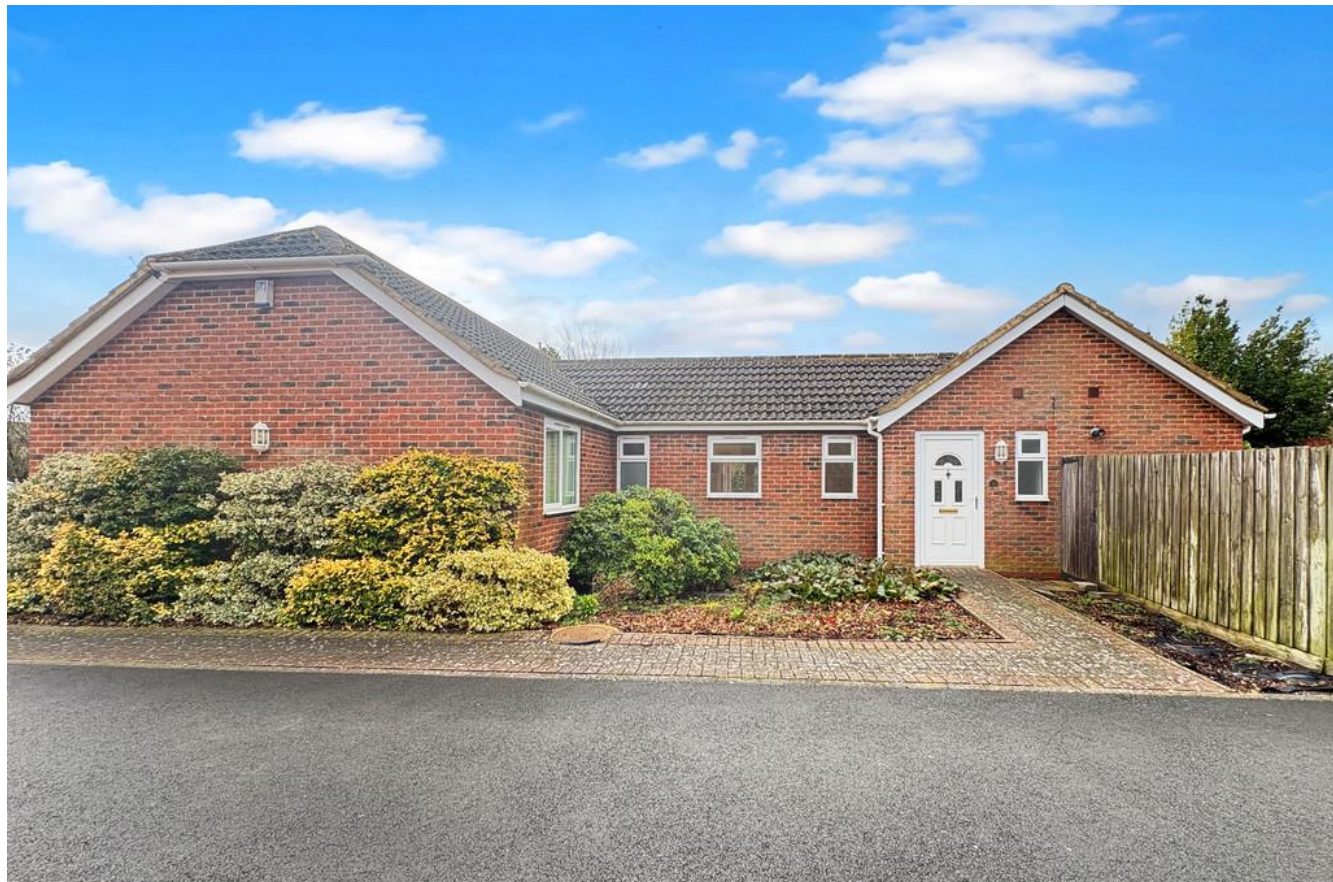
West Drive, Caldecote