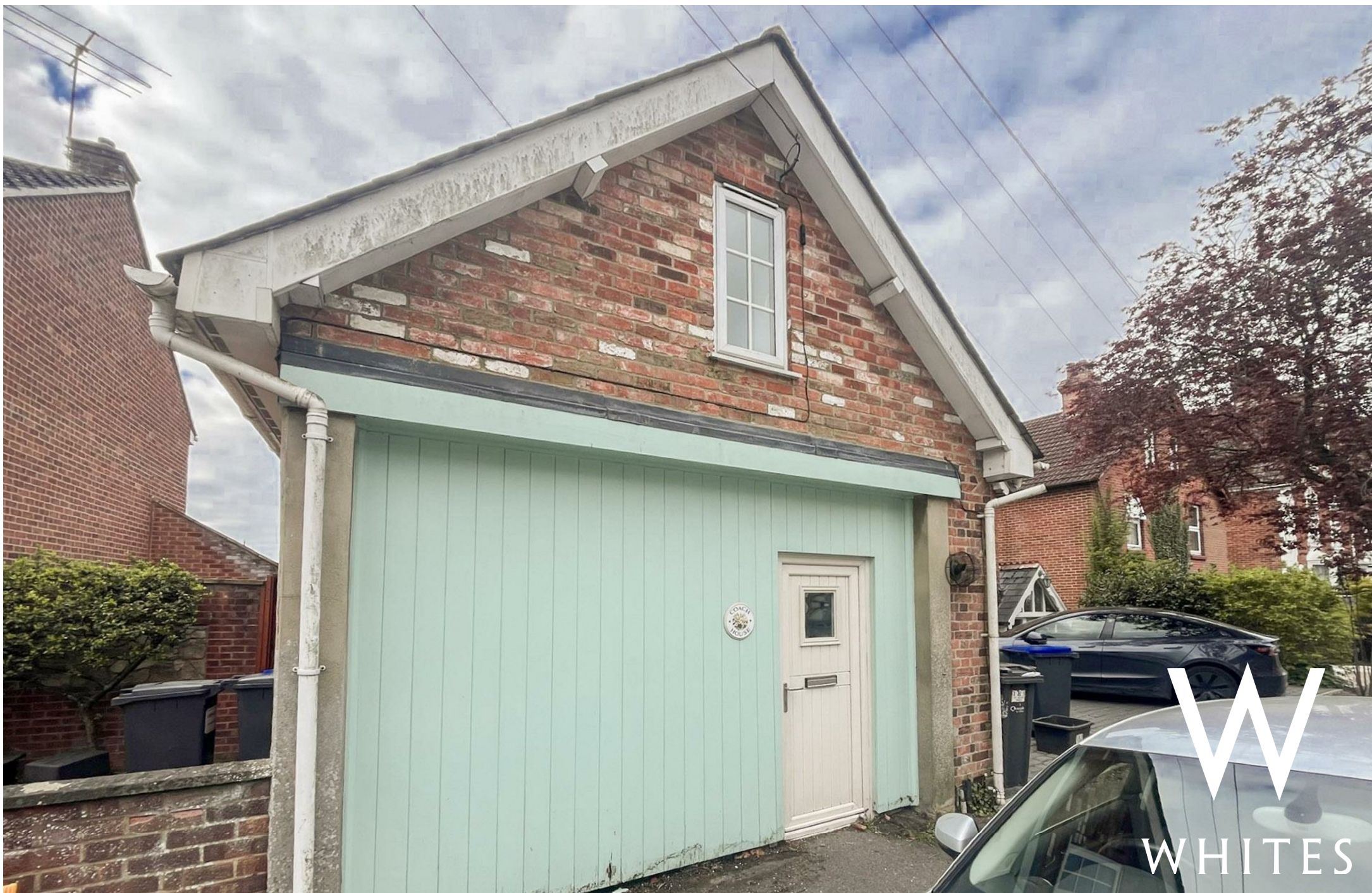
Coach House St Marks Road, Salisbury, Wiltshire, SP1 3AY