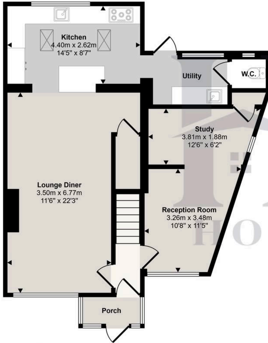
Ground Floor Approx 69 sq m / 744 sq ft

Approx Gross Internal Area 121 sq m / 1297 sq ft