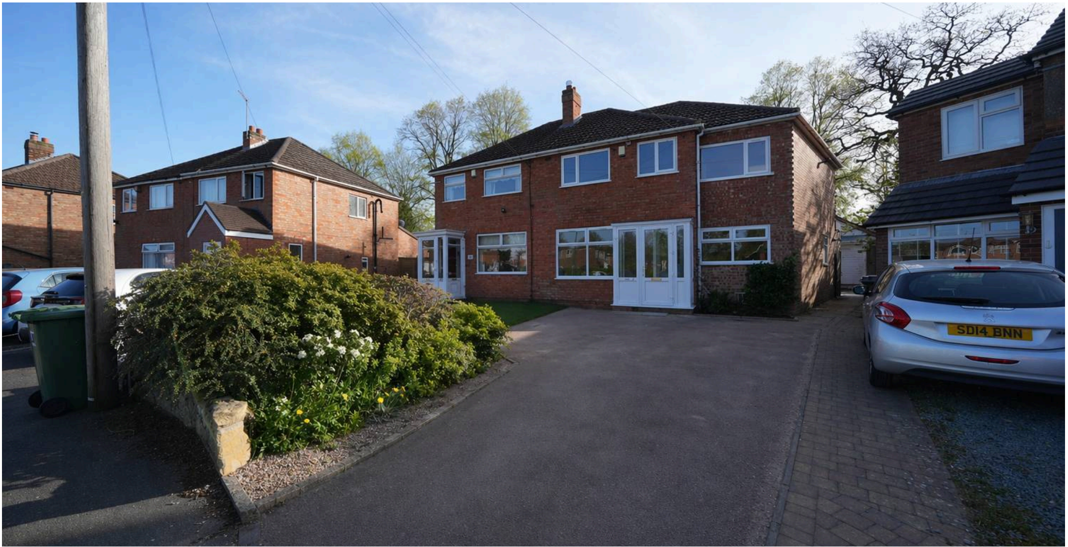
121 Chamberlain Crescent, Shirley Solihull