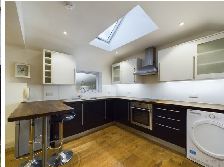
Flat 1 355 London Road, High Wycombe, Buckinghamshire, HP11 1EJ