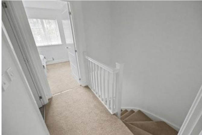
Bedroom One 4.08m x 3.13m (13'5" x 10'4")