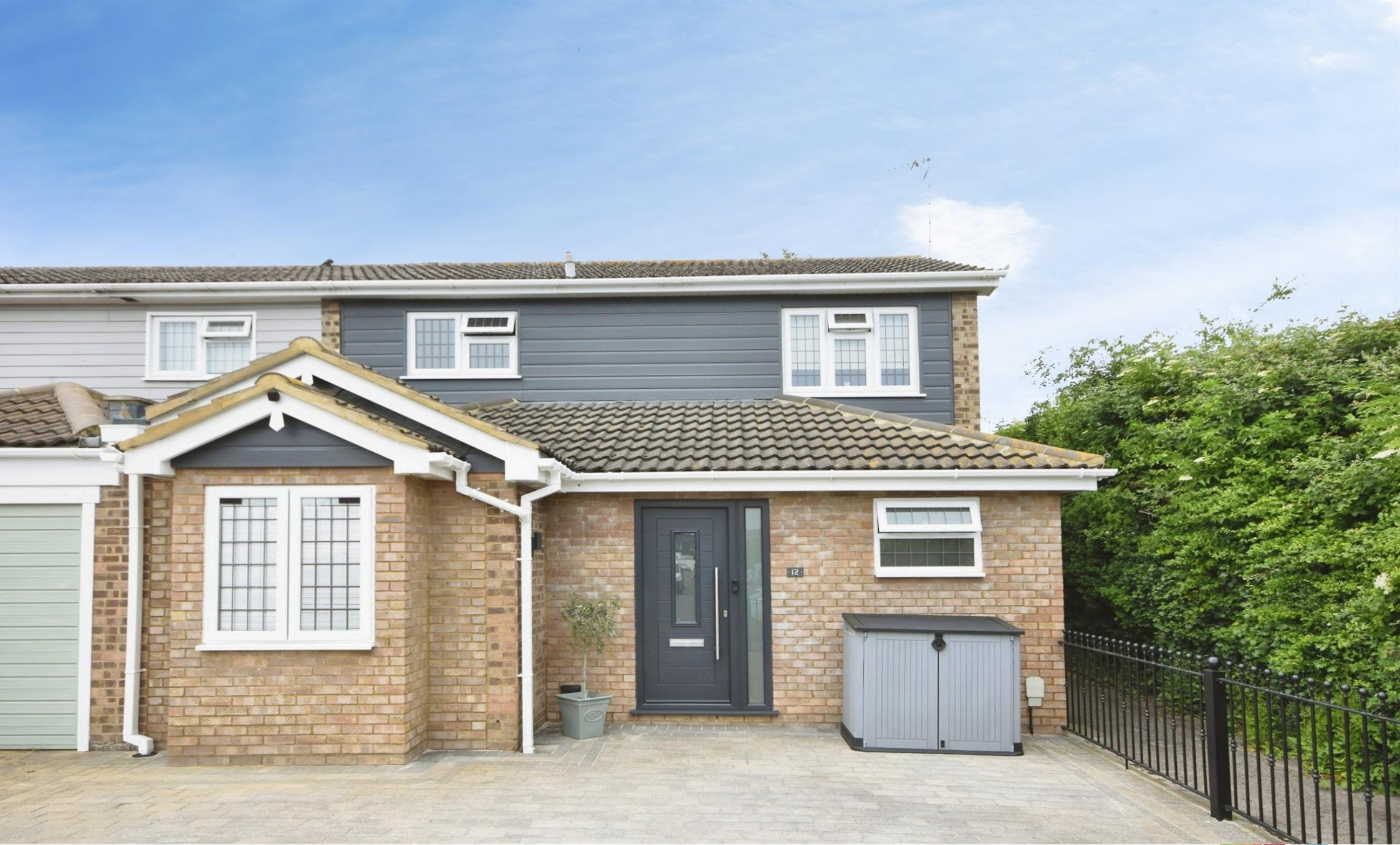
Jericho Place, Blackmore, Ingatestone, CM4 0SB