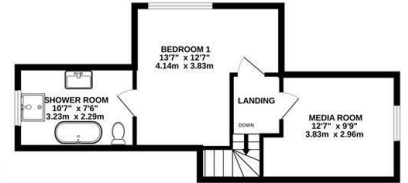
2ND FLOOR 387 sq.ft. (35.9 sq.m.) approx.