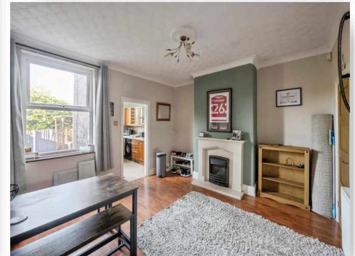
Station Road, Bolton-Upon-Dearne Rotherham S63 8AB