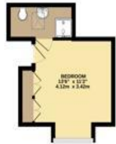
3RD FLOOR 181 sq ft (16.7 sq m) approx.