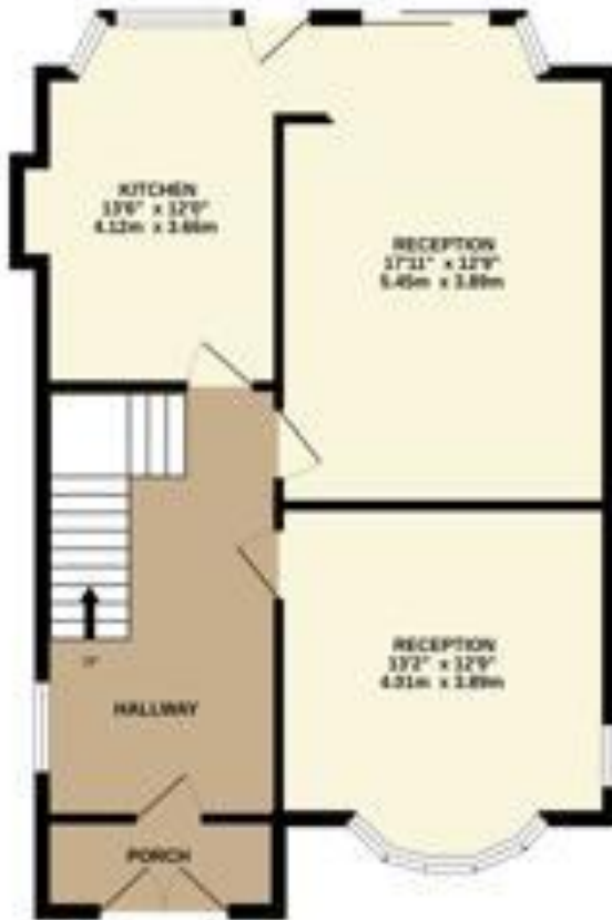
GROUND FLOOR 878 sq ft (81.1 sq m) approx.