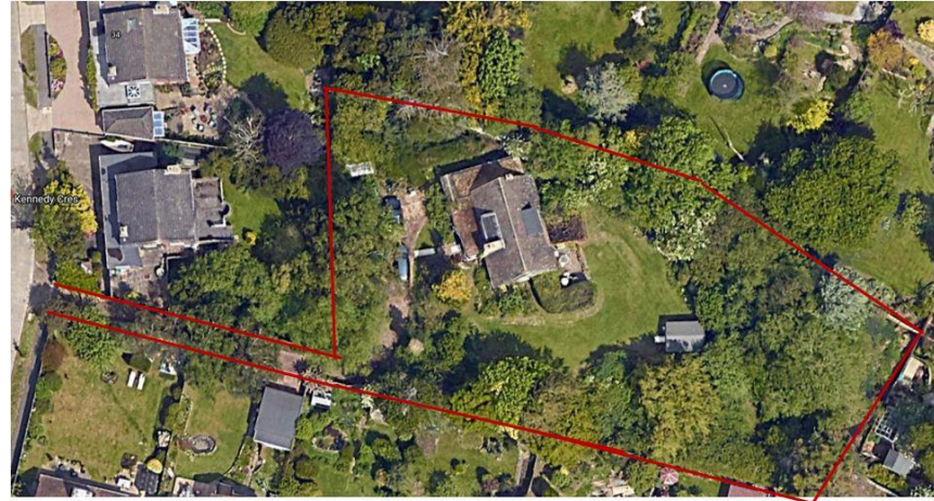
*Guide only* This may not represent the exact shape and size of the plot. We would strongly suggest before any purchase or expense that all interested parties view the official title plan for a better understanding.