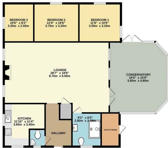
GROUND FLOOR 1483 sq.ft. (137.8 sq.m.) approx.

TOTAL FLOOR AREA: 1483 sq.ft. (137.8 sq.m.) approx. While every attempt has been made to ensure the accuracy of the floor plan, measurements of floors, windows, doors and any other items are approximate and no responsibility is taken for any error, omission or misstatement. This plan is for guidance only and should not be used as a basis for any purchase or other transaction. The plan is not a contract and no guarantee is given as to the accuracy or efficiency of the plan.