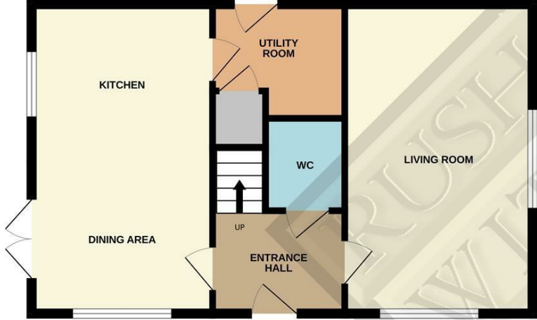
GROUND FLOOR 532 sq.ft. (49.4 sq.m.) approx.