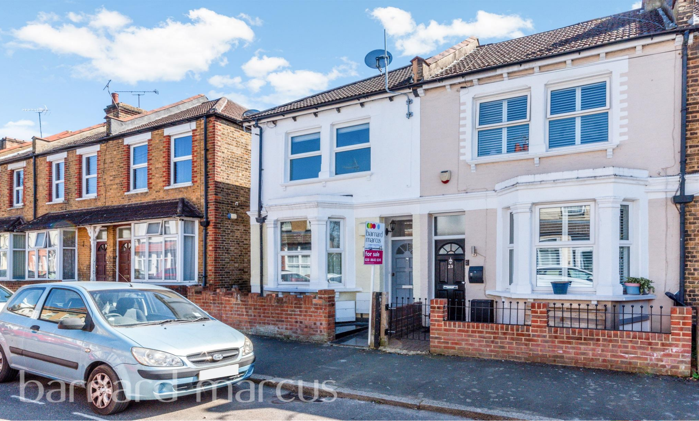
Sorrento Road, Sutton SM1 1QU