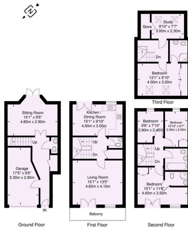
ILLUSTRATION FOR IDENTIFICATION PURPOSES ONLY ALL MEASUREMENT ARE MAXIMUM, AND INCLUDE WINDOW BAYS AND WARDROBES WHERE APPLICABLE THIS PLAN MUST NOT BE REPRODUCED BY ANY OTHER PERSON WITHOUT PERMISSION

5 Chancellor Grove Approximate Gross Internal Area = 159.3 sq m / 1714 sq ft