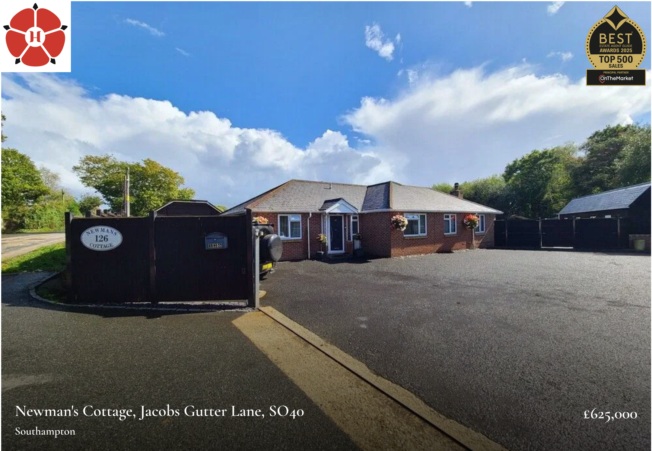
Newman's Cottage, Jacobs Gutter Lane, SO40 Southampton