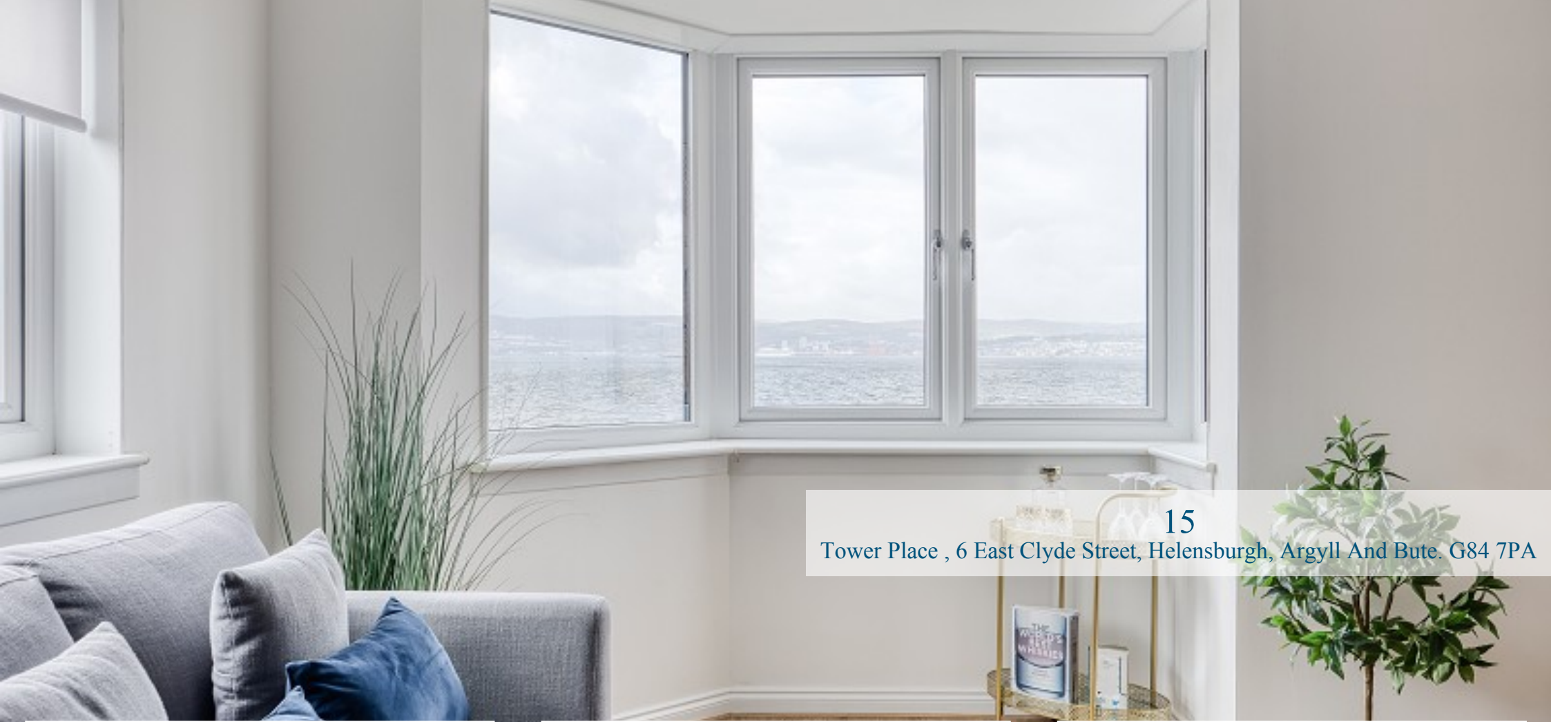
15 Tower Place , 6 East Clyde Street, Helensburgh, Argyll And Bute. G84 7PA