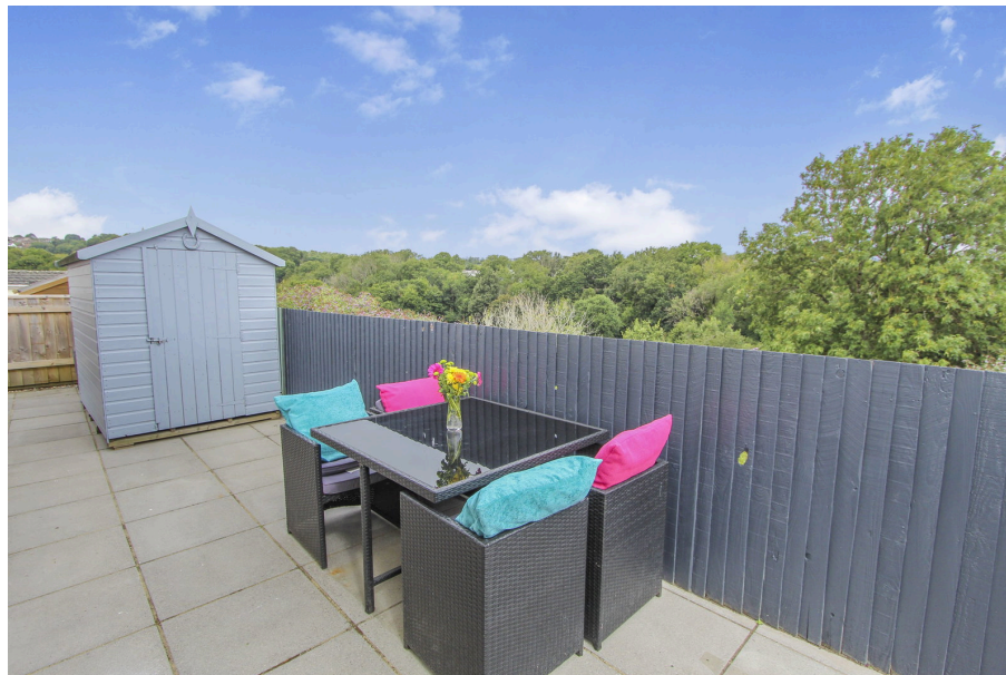
7 Fairlawns Park