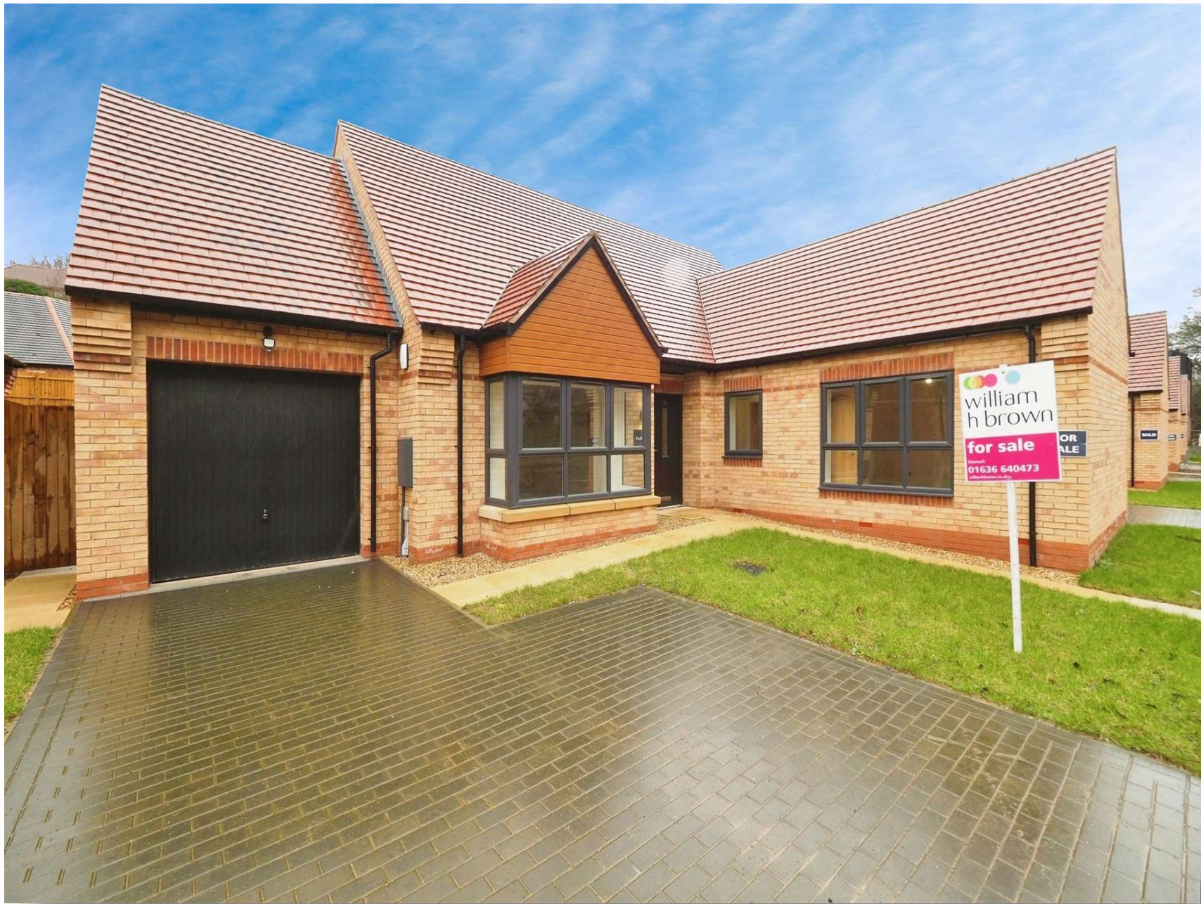
The Dove Valley Lane, Mansfield NG18 2EQ