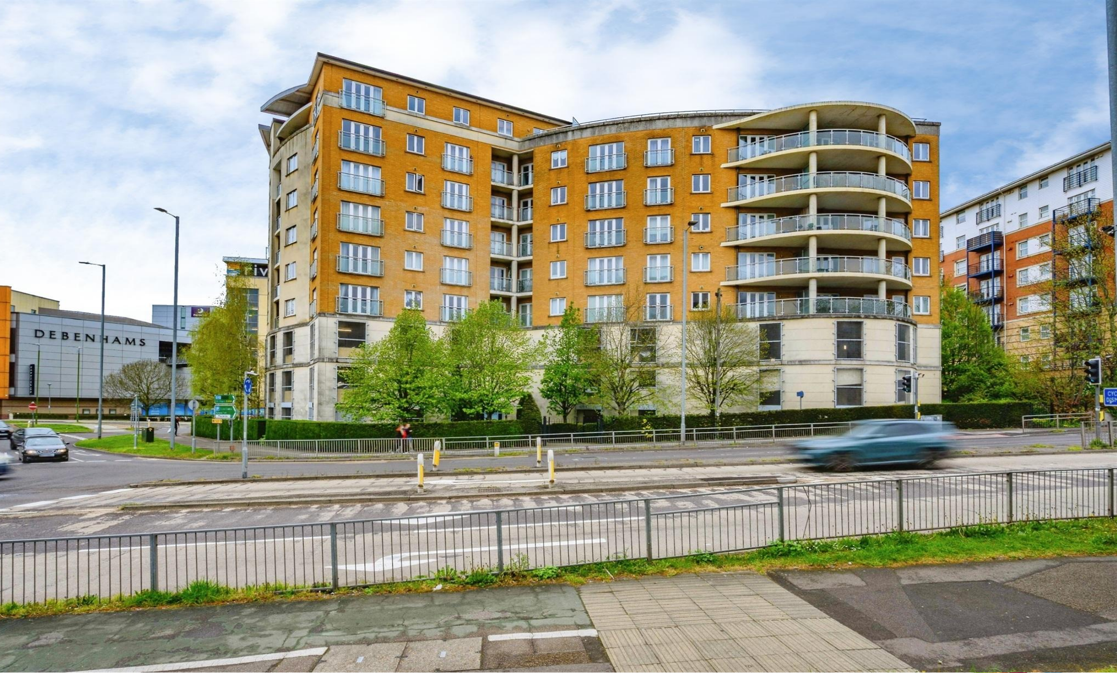
Handleys Court Selden Hill, Hemel Hempstead HP2 4FW