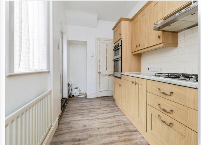
Coleridge Avenue, Hartlepool, TS25 5AA