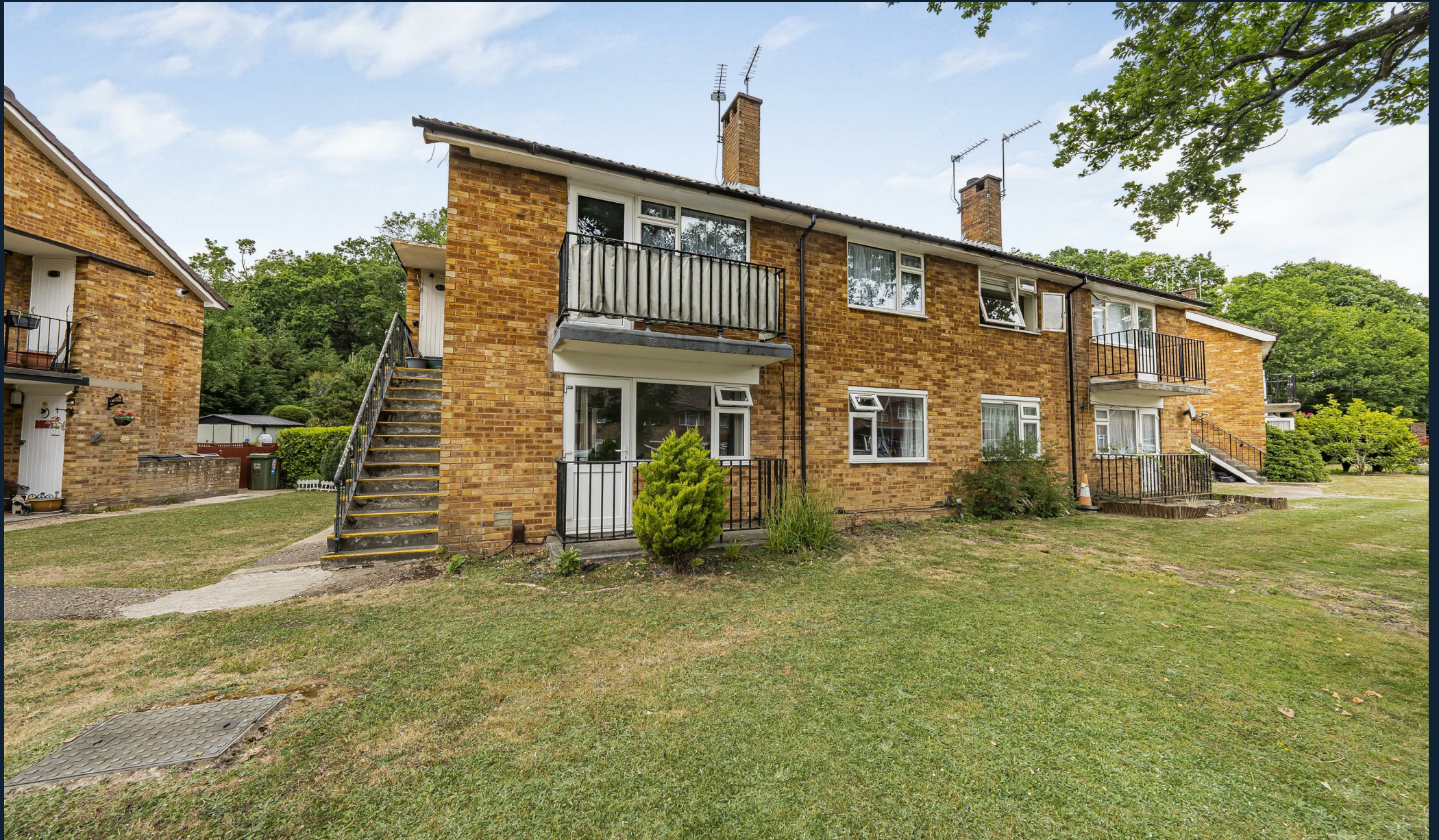
47 BLACK BOY WOOD, BRICKET WOOD, ST. ALBANS, AL2 3LW GUIDE PRICE £340,000